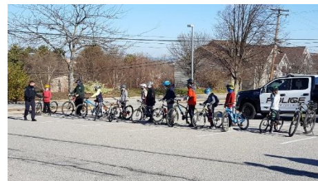
Bike safety, 11/29, submitted by Sekhar Bhattacharyya