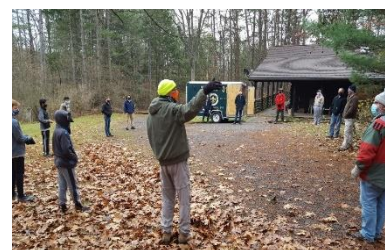
submitted by Sekhar Bhattacharyya