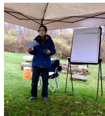
Annual adult planning, Slab Cabin Park, 11/15