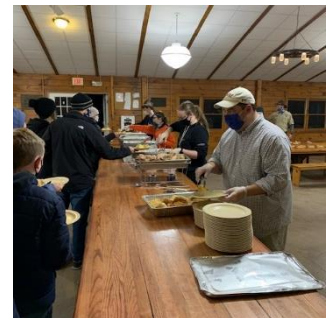
Turkey dinner, submitted by Jen Brauser