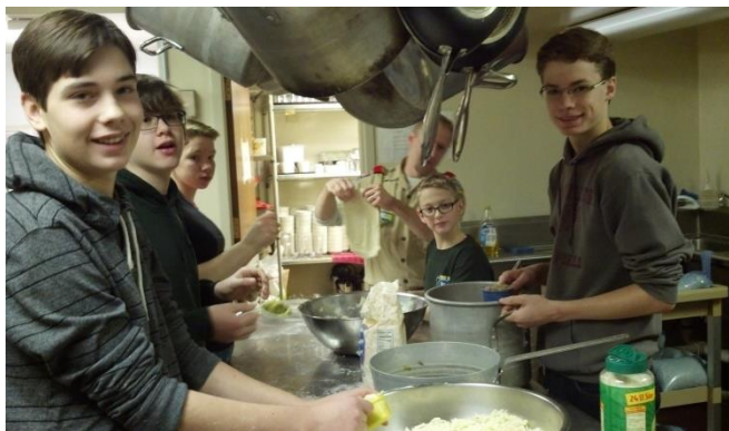
Scouts bake Stromboli for the annual fundraiser.