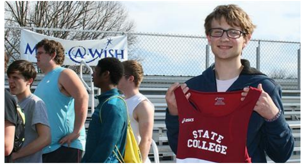
On March 23, Isaac presented new track uniforms to his high school teammates.