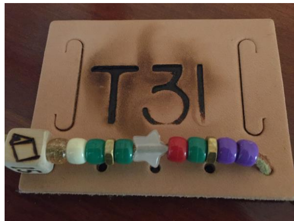
Here is a sample belt totem with beads representing a variety of troop activities including a glow in the dark star for summer camp attendance.