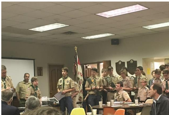
Scouts receive awards at the January Court of Honor.

Thank you for all of your hard work! These boys each won a gift certificate to Appalachian Outdoors and everyone who sells has money deposited into their troop account. Sales will begin again in fall 2016.