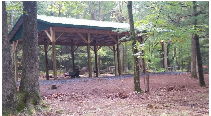
Photo of the Rhodes campsite pavilion.

Last spring, Troop 31 agreed to commit $5,000 to constructing a new pavilion at the Rhodes campsite at Seven Mountains. The pavilion was constructed just in time for us to enjoy it during summer camp in July. And now we are in the process of paying down that financial commitment. The Troop Committee would like to devote the $875 of the Millennium Fund toward this pavilion, but wants to be sure that donors to the Fund approve.