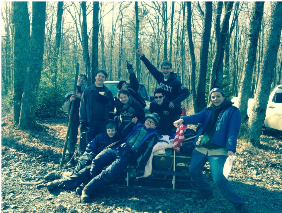
NITTANY VALLEY DISTRICT, JUNIATA VALLEY COUNCIL * CHARTERED BY ST. PAUL'S UMC